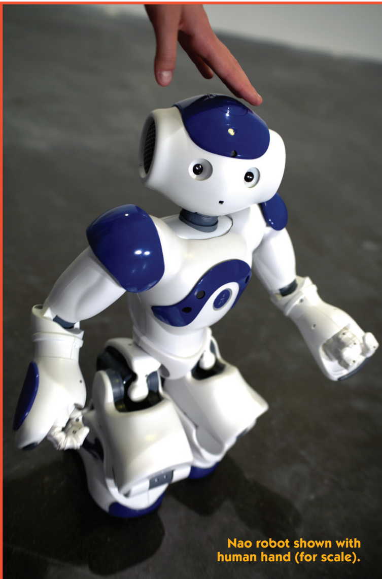
Nao robot shown with human hand (for scale).

Researchers have a variety of goals for artificial intelligence. Some scientists are examining human biology together with artificial intelligence in an effort to create robots that are as humanlike as possible. Still others examine AI from an engineering perspective, begging the question, what can robots be enabled to do?